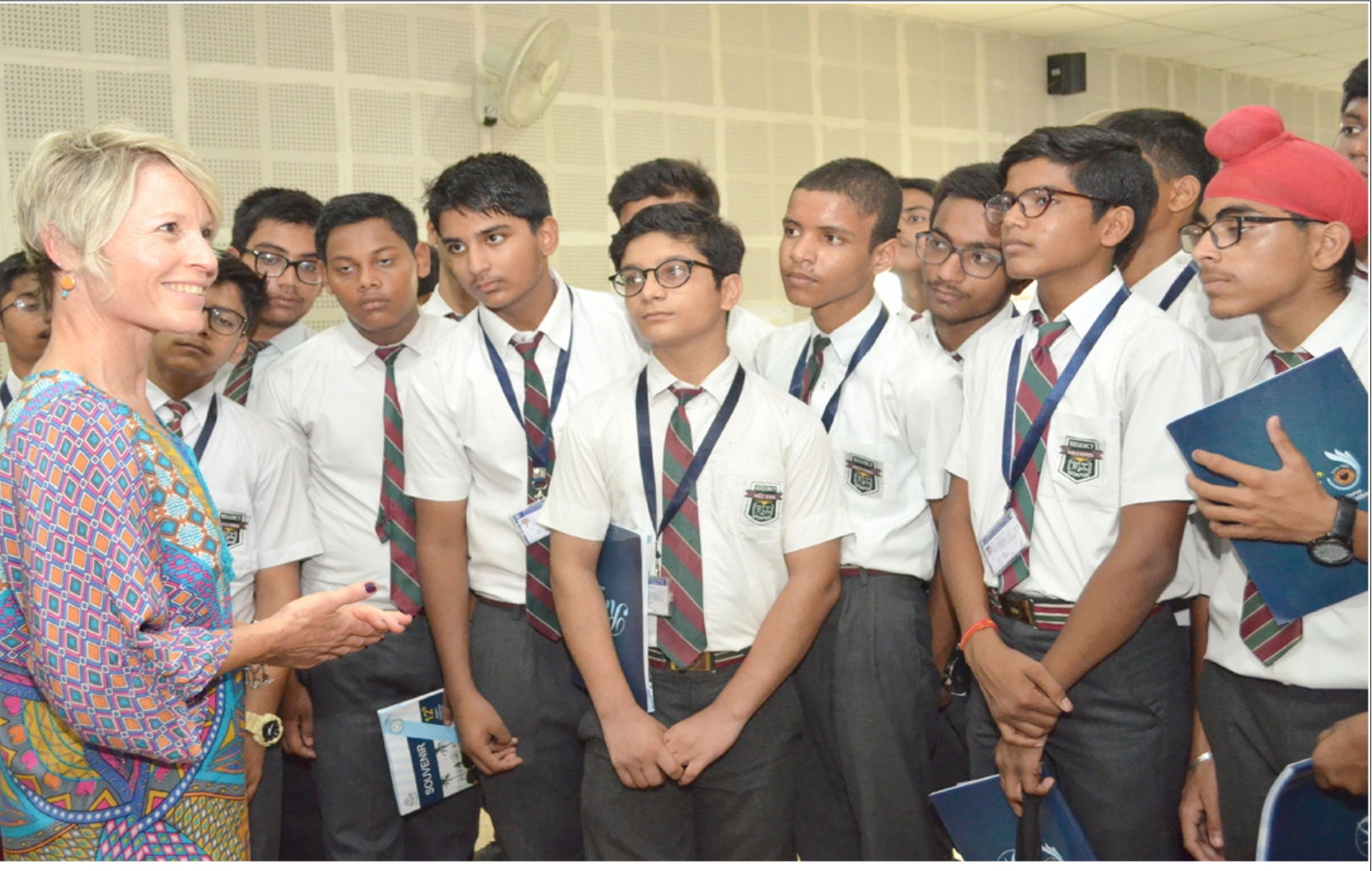
Man depends on man's kindness. Come, let us embrace humanity with kindness.